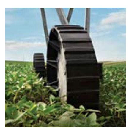
NFTrax's unique design controls water runoff and reduces track erosion for faster field drying time.

Without large ruts, growers will spend less time repairing fields, and experience less wear and tear on all types of farm equipment.